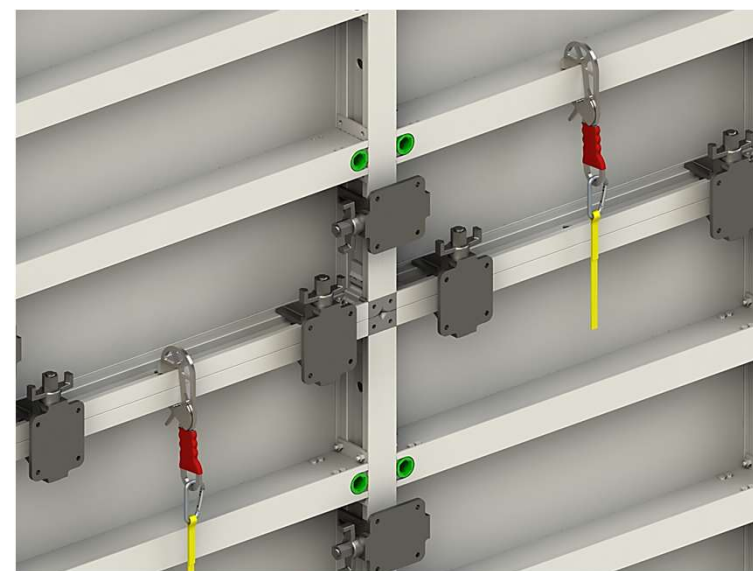
<u>Figure 2.</u> Personal Tie-Off Lanyard Device ONLY Attached The Horizontal Inner-Rail OR Horizontal Siderail Joint